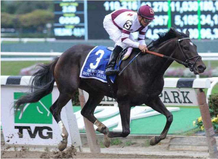
Royal Delta winning the Beldame